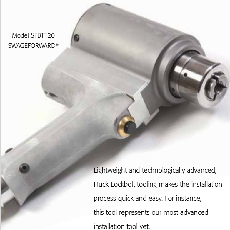
Model SFBTT20 SWAGEFORWARD®

Lightweight and technologically advanced, Huck Lockbolt tooling makes the installation process quick and easy. For instance, this tool represents our most advanced installation tool yet.